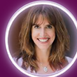
CAT COODE DATA AND PRIVACY STRATEGIST BINARY TATTOO